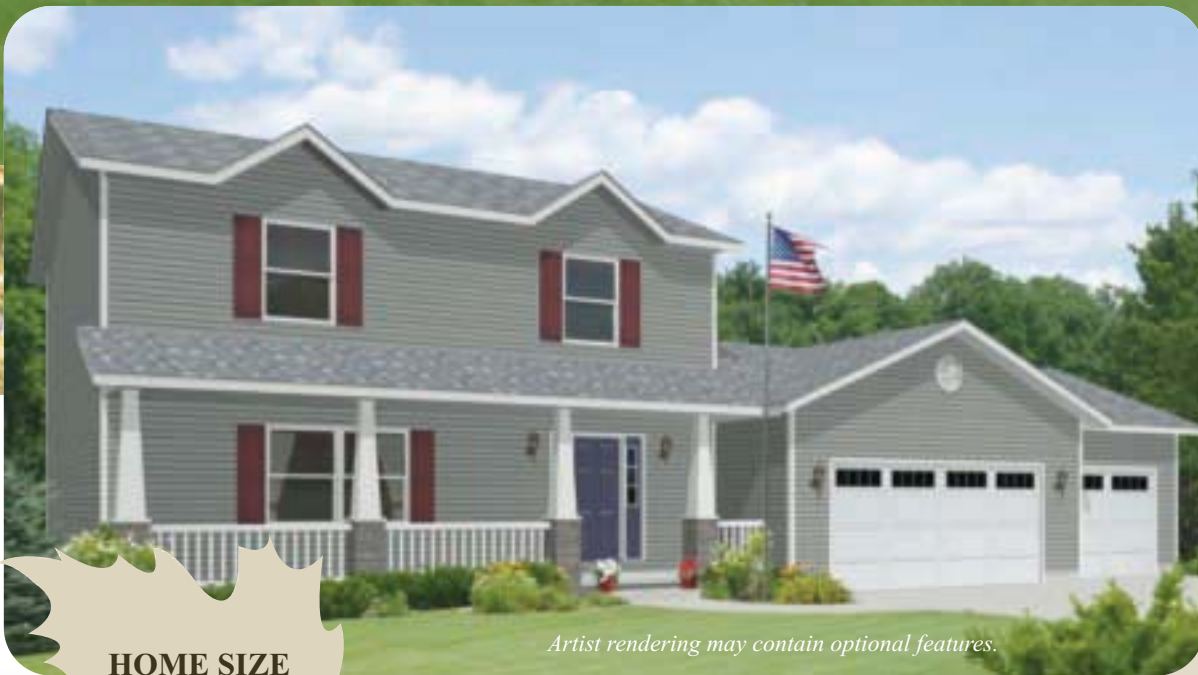
Artist rendering may contain optional features.